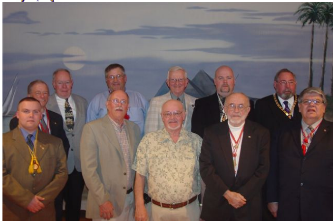
Members attending the March 18 th Dad Land founders day celebration